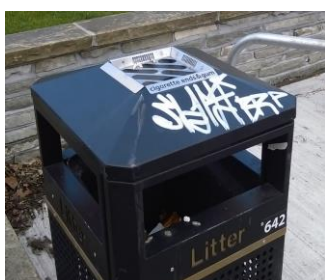
Northampton Street graffiti