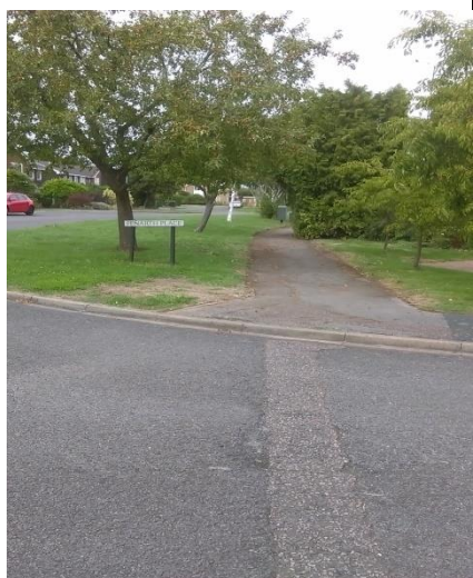
Gough Way cutback