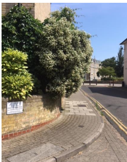
Overgrown hedge at Castle Row

We have completed various projects and works with the support of Community Payback including; renewing the woodchip path at the paradise Nature Reserve, cutting back overgrown hedges obstructing pedestrian walkways at castle Row and various low level graffiti removal (examples below)